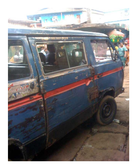
Mini bus (poda poda) at Elk Street

During our visits to the Kenema station, review of document revealed that vehicle examiners issued certificates of fitness and licenses to vehicles without completion of checklist and signature on them.